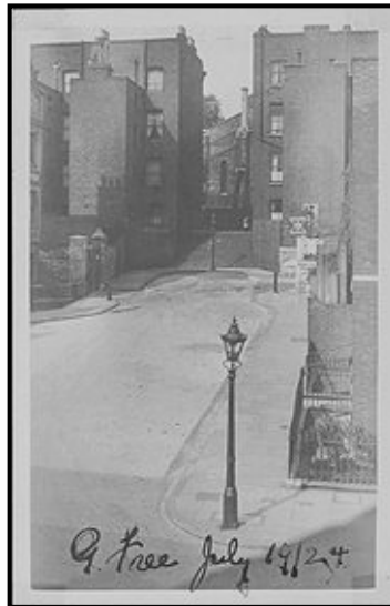
Gwynne Place in 1924.

Satire and pathos are grippingly combined in Arnold Bennett's masterpiece of London life. Set between 1919 and 1920, it's an intensely focussed story displaying a scalpel-like characterisation of the lower middle-classes struggling to maintain status, respectability and income against all sorts of unruly human instincts and desires. The story takes place in and around a secondhand bookshop on the King's Cross Road; it charts the courtship and marriage of a bookseller, the miserly Mr Earlforward, to the vivacious but lonely widow, Mrs Arb, and follows the triumphs and setbacks of their relationship and shared passion for thrift which is eventually to prove their downfall. Economy becomes a corrosive desire which contrasts dramatically with the spontaneous greed for life embodied in the warmth of their 'general' maid, Elsie and her tender love for the shell-shocked Joe.