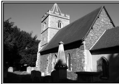
St. John the Baptist, Great Amwell